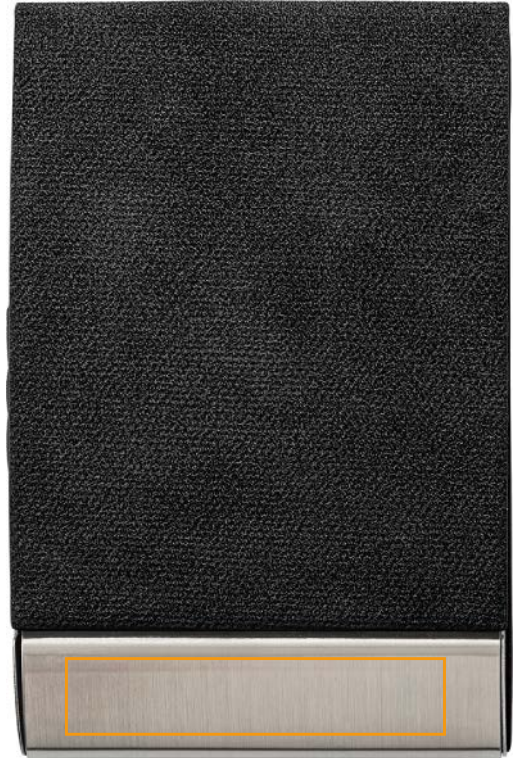
2. TOP SIDE