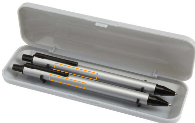
4. NEAR CLIP LEFT HANDED