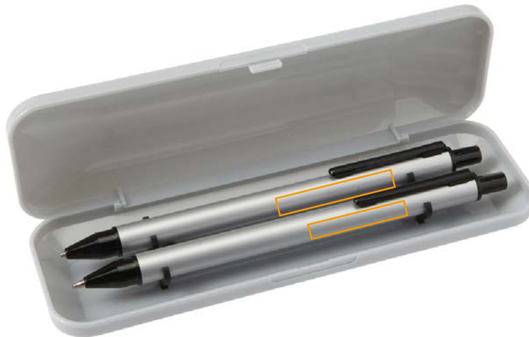
2+3. NEAR CLIP RIGHT HANDED