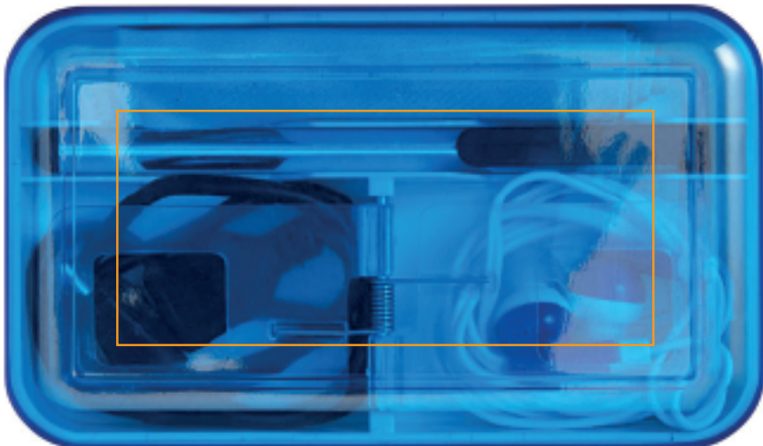
3. TOP SIDE