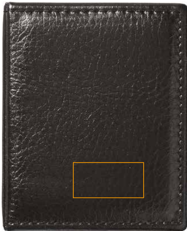
2. TOP SIDE