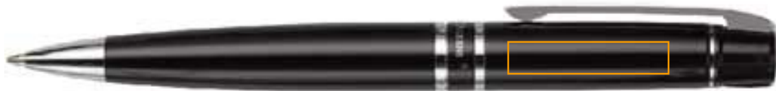
1. NEAR CLIP RIGHT HANDED