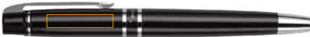
2. NEAR CLIP LEFT HANDED