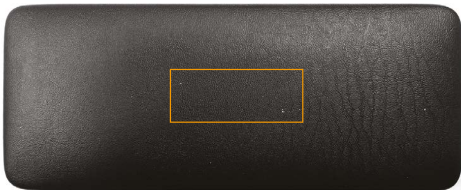
3. TOP SIDE