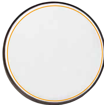
5. TOP SIDE