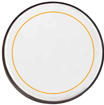
3. TOP SIDE