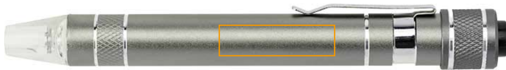
1 + 3. NEAR CLIP RIGHT HANDED